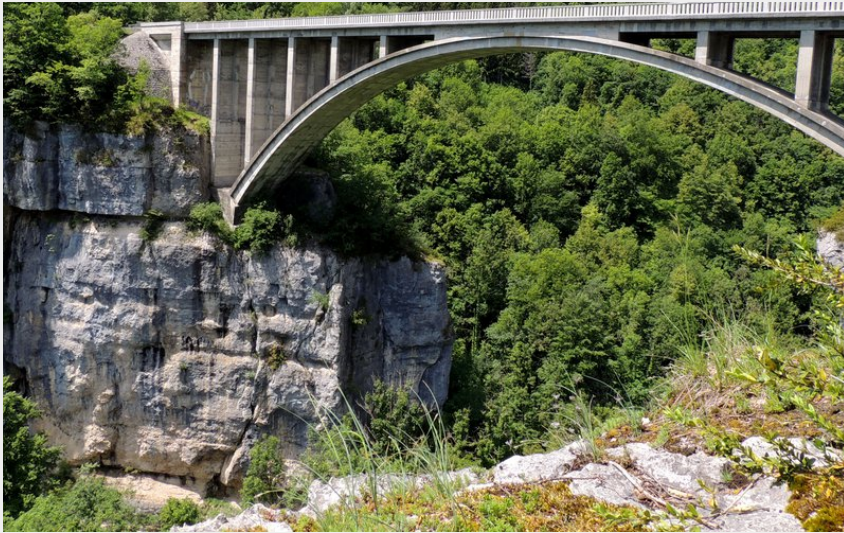
Le Pont du Moulin des Pierres