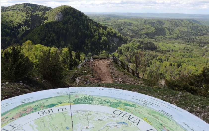
Attribution : Le belvédère du Pic de l'Aigle (PNRHJ - F. Jeanparis)