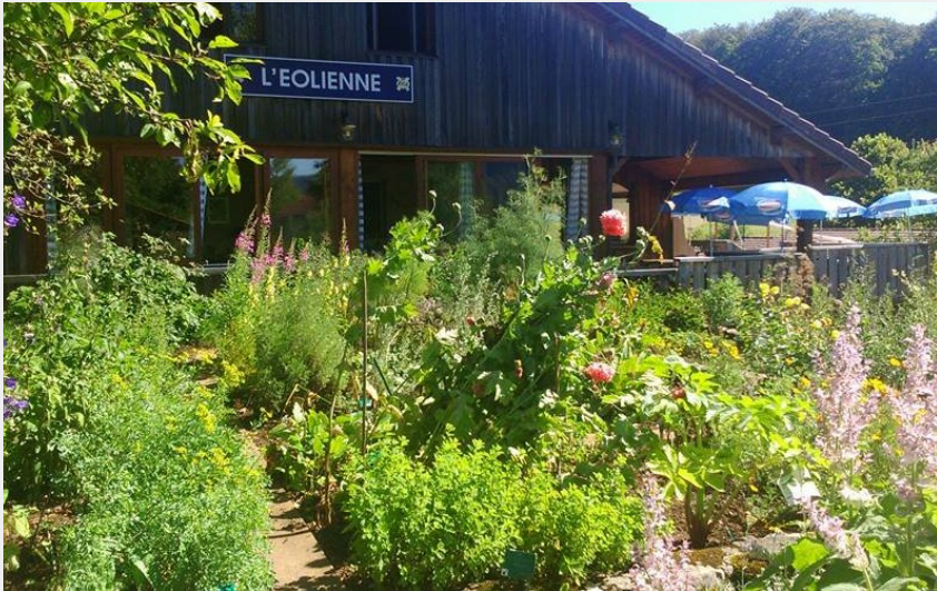
Attribution : Eolienne (Eolienne)