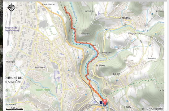
Pertes de la Valserine

From the heart of Bellegarde, this hike leads to the bowels of the Valserine, an affluent of the Rhône.