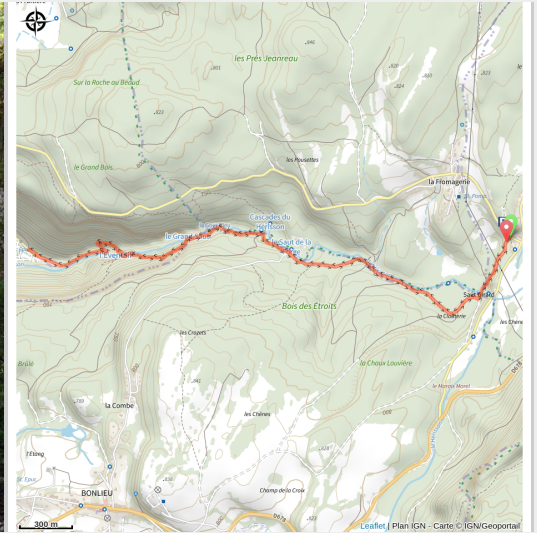
Le Saut de la Forge

An unmissable natural site within the Jura, the Hérisson waterfalls live up to their reputation. A trail adapted with walkways, stairs and belvederes allows hikers to admire the river's amazing lines from one waterfall to another.