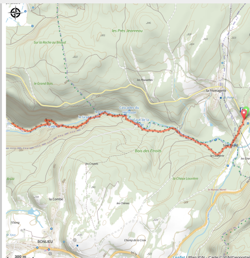
Le Saut de la Forge

An unmissable natural site within the Jura, the Hérisson waterfalls live up to their reputation. A trail adapted with walkways, stairs and belvederes allows hikers to admire the river's amazing lines from one waterfall to another.