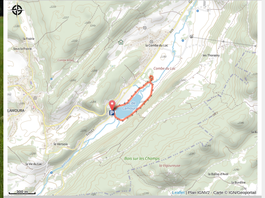
Sentier du lac de Lamoura (PNRHJ / Nina Verjus)

The trail goes around the lake. A wooden boardwalk allows hikers to cross the most humid areas and the peat bog without damaging these fragile environments.