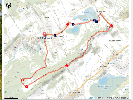
Tourbière de Fort-du-Plasne

A walk along the ridges offers an unexpected view over the municipalities of the Lac des Rouges Truites and Fort du Plasne, their lakes and their peat bogs.