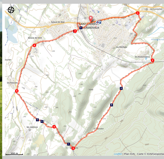
Point de vue des Jeannez

Grandvaux's dynamic agriculture produces infamous cheeses such as Comté and Morbier. It also contributes towards maintaining the open landscapes of this walk along the outskirts of meadows and woods.