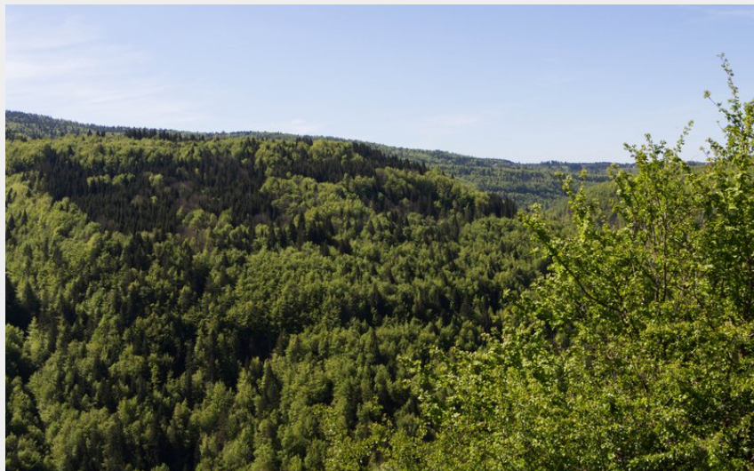
Point de vue (PNRHJ / Nina Verjus)