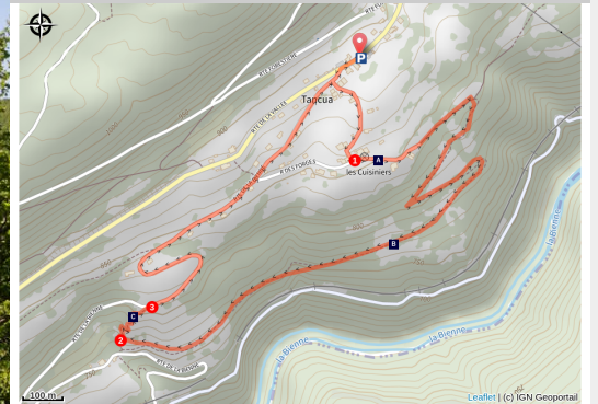
Point de vue

A walk accessible to all departing from a village in the Biemme valley and enabling hikers to discover the valley's viewpoints and few dry grasslands along pleasant paths and trails.