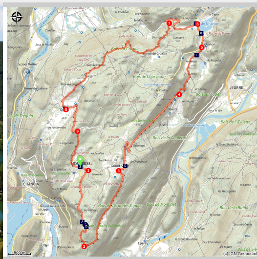
Lac de Coiselet

From the sunny hillside of the Bienne valley to the shaded and wooded hillside of the Ain valley, a long walk linking the industrious hamlets around Montcusel and Martinga.