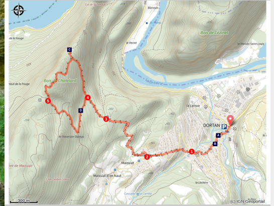
Cascade de tuf

From the workers' town of Dortan, this walk takes you through the Chatelard forest to the Pierre-qui-Vire, a rocky promontory above the Coiselet lake.