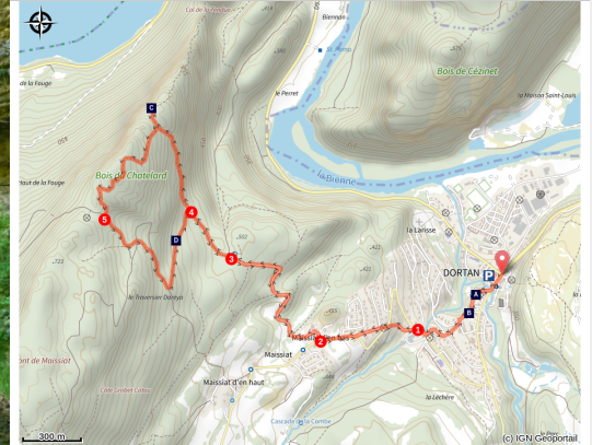
Cascade de tuf

From the workers' town of Dortan, this walk takes you through the Chatelard forest to the Pierre-qui-Vire, a rocky promontory above the Coiselet lake.