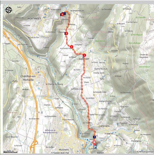
La Voie du Tram à La Mulaz

No risk of delay on the Bellegarde - Pont des Pierres connection. You can calmly pedal along the Tram Line, a historic line with an easy slope which is now adapted to accommodate pedestrians and bicycles.