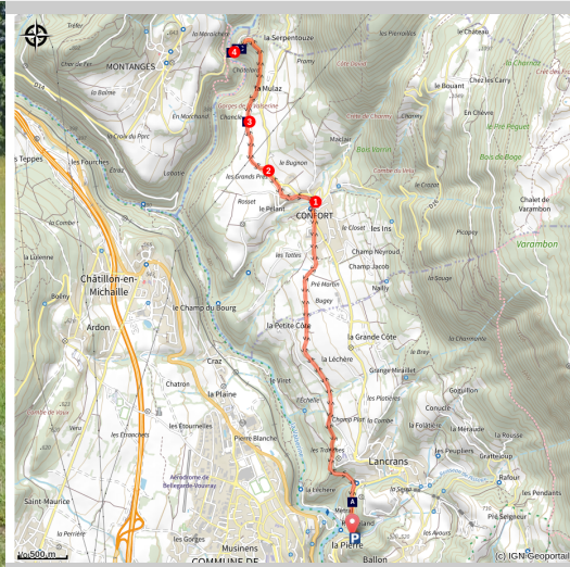
La Voie du Tram à La Mulaz

No risk of delay on the Bellegarde - Pont des Pierres connection. You can calmly pedal along the Tram Line, a historic line with an easy slope which is now adapted to accommodate pedestrians and bicycles.