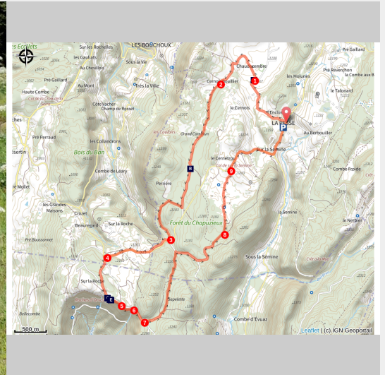
Les Roches d'Orvaz

Forests, clearings and prairies, full of life, culminating at the jagged cliffs of the Rocks of Orvaz for a well-deserved break with a clear view over the valley of the Semine and the Orvaz cirque.