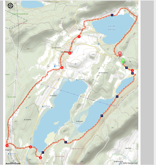
Lac de Narlay (CCPays des Lacs)

Petit Maclu and Grand Maclu, Ilay and Narlay: these are four emblematic lakes of the riparian Jura landscape often called "Little Scotland".