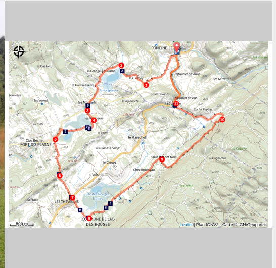
Lac à la Dame

A succession of rolling paths and little roads on the plateau, departing from Foncine-le-Bas, where the Seine flows.